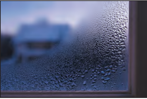
Condensation on the inside of a window-pane.